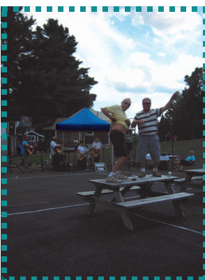
Lots of fun and good sports at the Family Day!