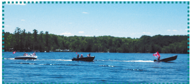
Colourful displays and happy patriotic onlookers as the 2011 Canada Day Boat Parade went through Mitchell Bay!