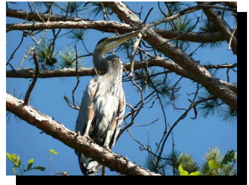
Blue Heron