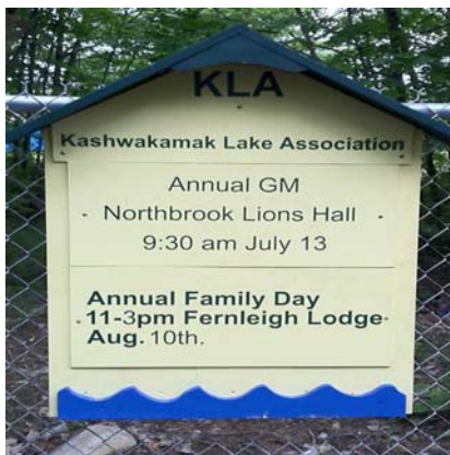
Look for the new KLA Message Boards around the lake.