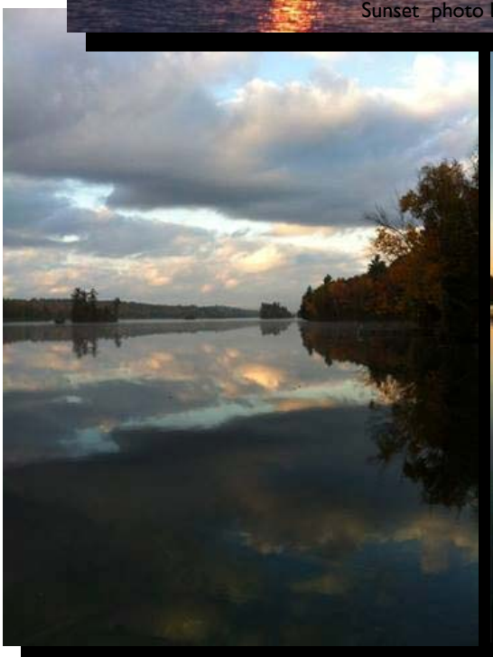
Early morning on Kash.