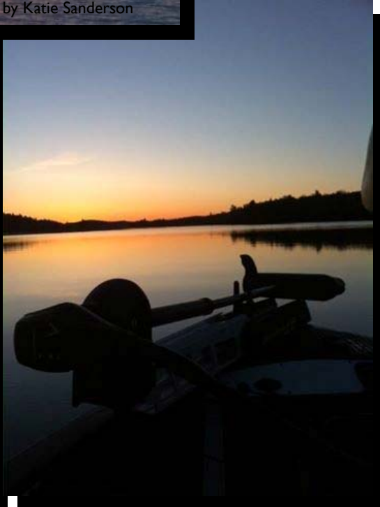
Late day ...