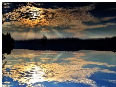
Myers Cave Road @ Happy Landing

with them to try to determine the frequency as well as the types of warnings and charges laid. We have managed to find out there are two detachments that have jurisdiction on Kashwakamak Lake with the regular marine units. There is also a S.A.V.E. (Snowmobiles – ATV's – Vessels – Enforcement) unit that is the wild card and so far, we have not received their statistics. The marine unit police who attended the Annual Family Day said S.A.V.E is an independent unit and the marine police unit does not know when or where S.A.V.E is on the lake. In fact, they could potentially all be there the same time. Our advice: make sure you and your guests have all the proper equipment required by marine law and don't consume alcohol.