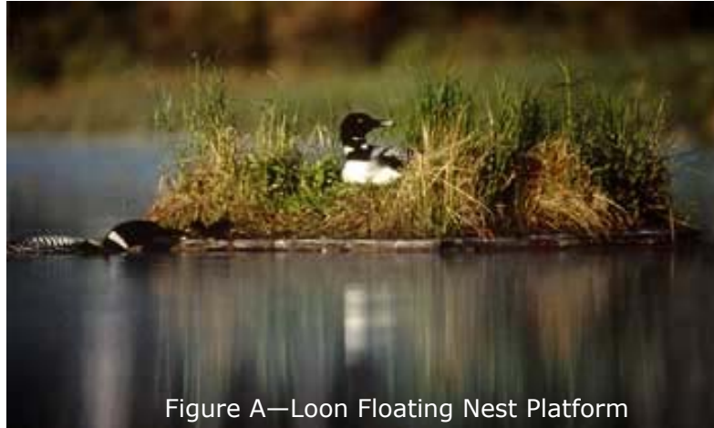
Figure A—Loon Floating Nest Platform

After a bountiful 2012 year, where we saw nearly every breeding pair producing hatchlings (in most cases two) we have seen the production rate drastically decline this season. Cottagers have only reported sightings of hatchlings numbering two. One hatchling was reported in the Weiss Point / Fernleigh Lodge area and the other at the west end of Kashwakamak Lake. This poor showing is likely caused by high water submerging existing Loon Nesting areas. Loons will not lay eggs in these conditions.