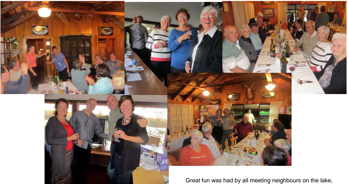
Great fun was had by all meeting neighbours on the lake, bidding at the Silent Auction and eating a great meal!