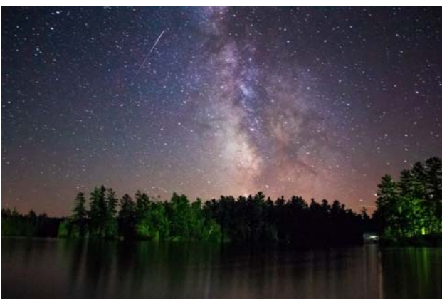
Labour Day—Milky Way over Twin Oaks

Loons can stay under water for almost a minute and can dive to depths of 80 m.