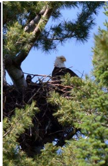
Kash Lake Eagle