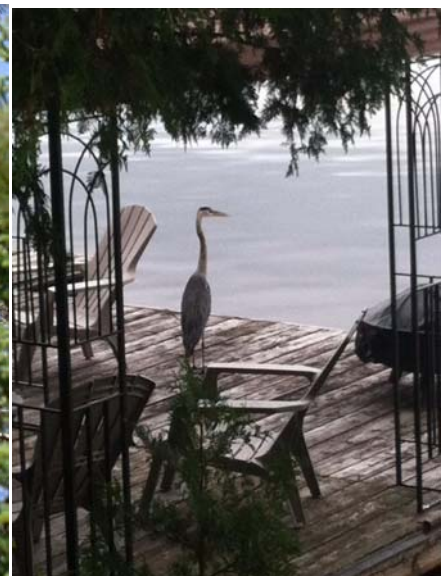
Blue Heron