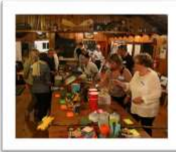
Great fun - 2016 Annual Dinner & Silent Auction

All proceeds from the Silent Auction and raffle will go to a local community charity. People are also asked to bring their "gently used items" for auction as well as non-perishable food donations for the local food bank.