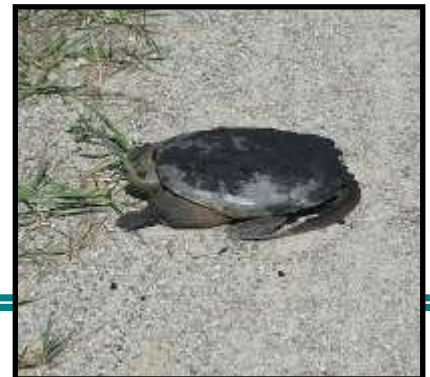
Facebook May 31, "First snapper rescue"

For further information, please contact the Public Works Administrative Assistant at 613-479-2231 ext. 227 or pwassistant@northfrontenac.ca .