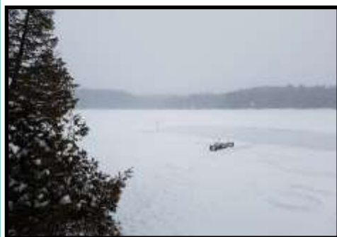
December 31 "Skating rink"