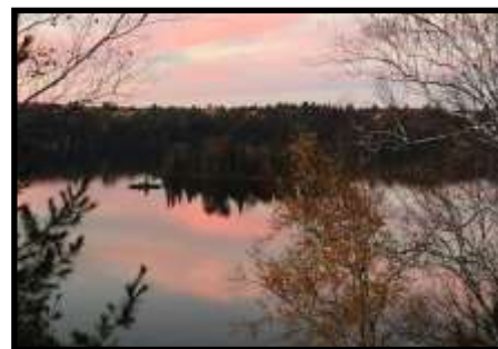
Nov 5 "Sunset"