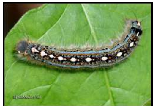
Forest Tent Caterpillars