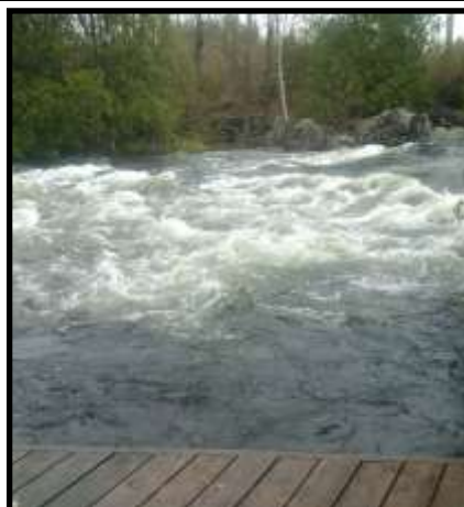
May 13, "Whitefish Rapids"